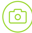
Image recognition technology development

Development of advanced gaming, financial or health platforms/frameworks