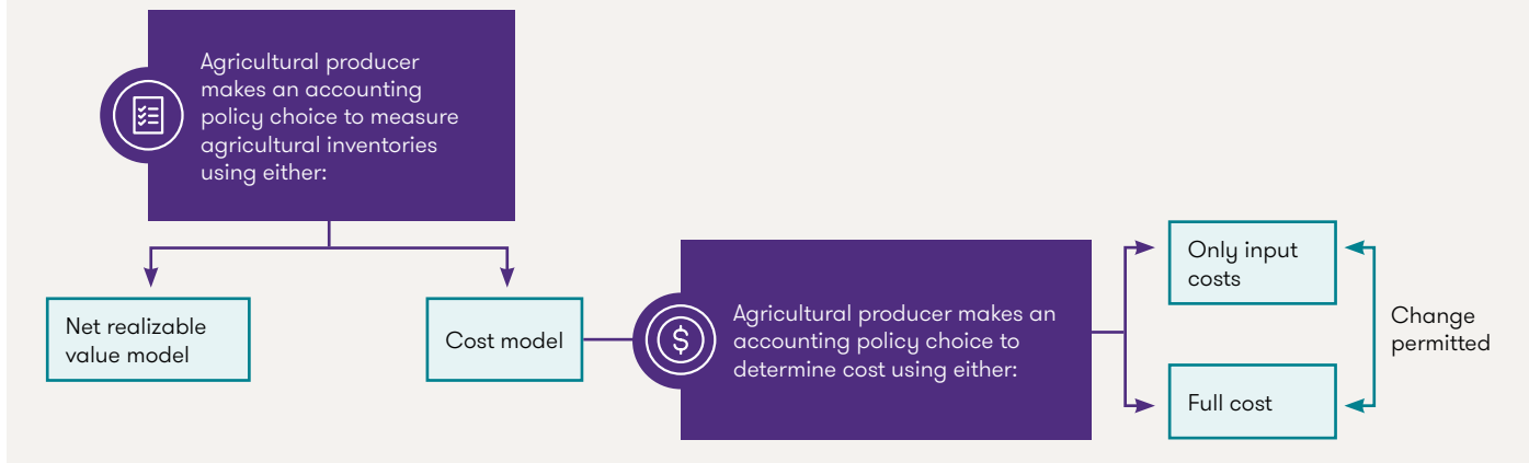
Diagram 1: Making an accounting policy choice

Regardless of which method is used to account for agricultural inventory, the agricultural producer will recognize the carrying amount of the agricultural inventories as an expense in the period in which it is sold. Furthermore, any costs incurred in the production of agricultural inventory which are excluded from the cost (e.g., abnormal amounts of wasted material/labour, administrative overhead, selling costs) are expensed in the period incurred.